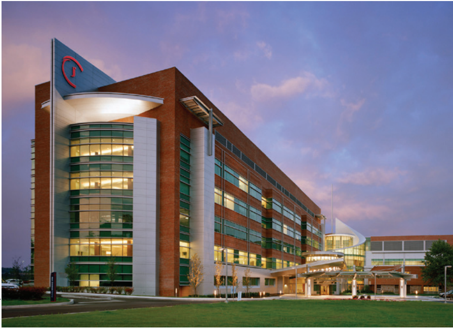
Jersey Shore University Medical Center in Neptune is affiliated with the University of Medicine and Dentistry of New Jersey - Robert Wood Johnson Medical School.