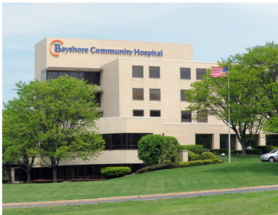
Bayshore Community Hospital in Holmdel.

Today, the 620-bed regional medical center specializes in cardiac care and surgery, superior cancer care, innovative orthopedics and rehabilitation, and the most comprehensive pediatrics care in the region.