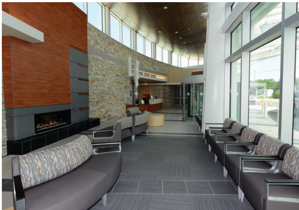
The emergency department entrance at Southern Ocean Medical Center in Manahawkin.