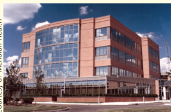
Southern Ocean Medical Center.

SOUTHERN OCEAN MEDICAL CENTER 1140 Route 72 West, Manahawkin, (609) 597-6011 www.southernoceanmedicalcenter.com