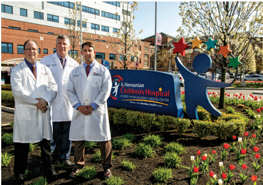
K. Hovnanian Children's Hospital at Jersey Shore University Medical Center in Neptune.

Today, Raritan Bay offers a total of 501 beds at its Perth Amboy and Old Bridge facilities.