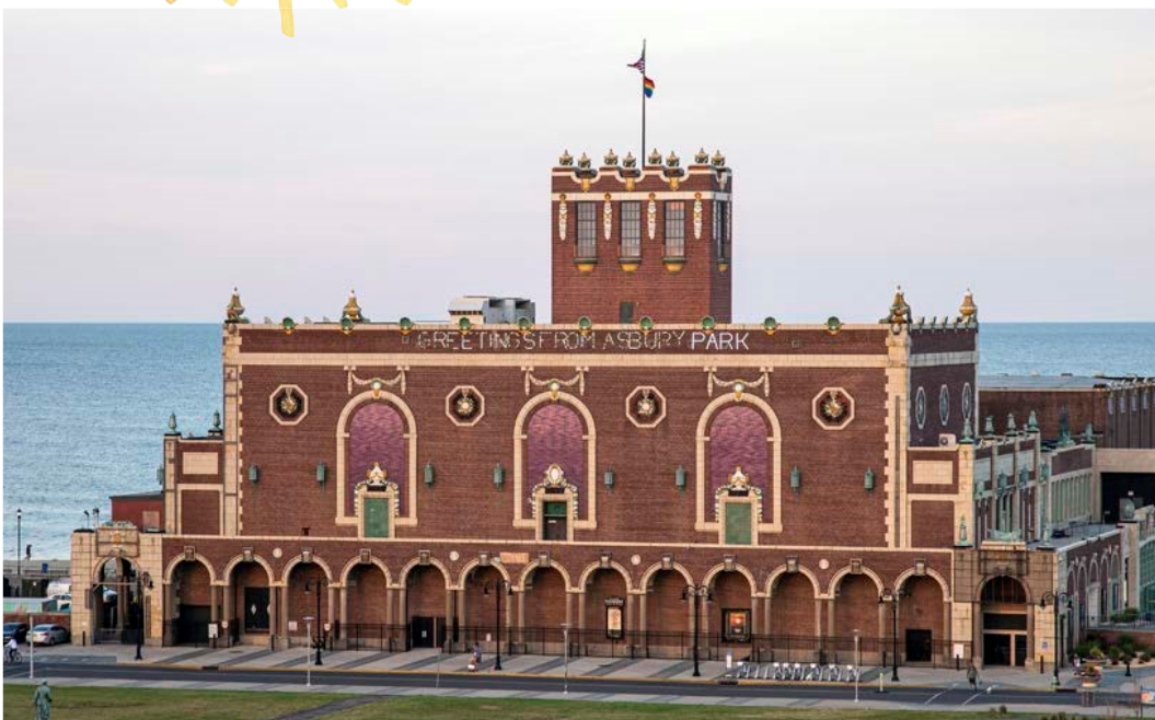
The Paramount Theatre, on the Asbury Park boardwalk, is the primary venue for events at the festival.

Thursday, April 23 - Sunday, April 26, 2020