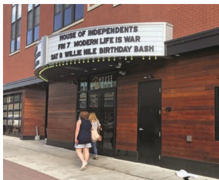
The Bob Dylan Center will present Dylan Archives V , featuring rare Bob Dylan performance footage and never-before-seen clips, at the House of Independents on Sunday, April 26.

The APMFF works with both Paramount Theatre and the Count Basie Center for the Arts to offer year-round programming with partial proceeds benefiting the APMFF mission, culminating in the yearly festival. No matter the names on the marquee, the beneficiaries—the children and youth of the festival's hometown and surrounding area—are of the utmost importance. According to the APMFF, Asbury Park is considered one of the most challenged