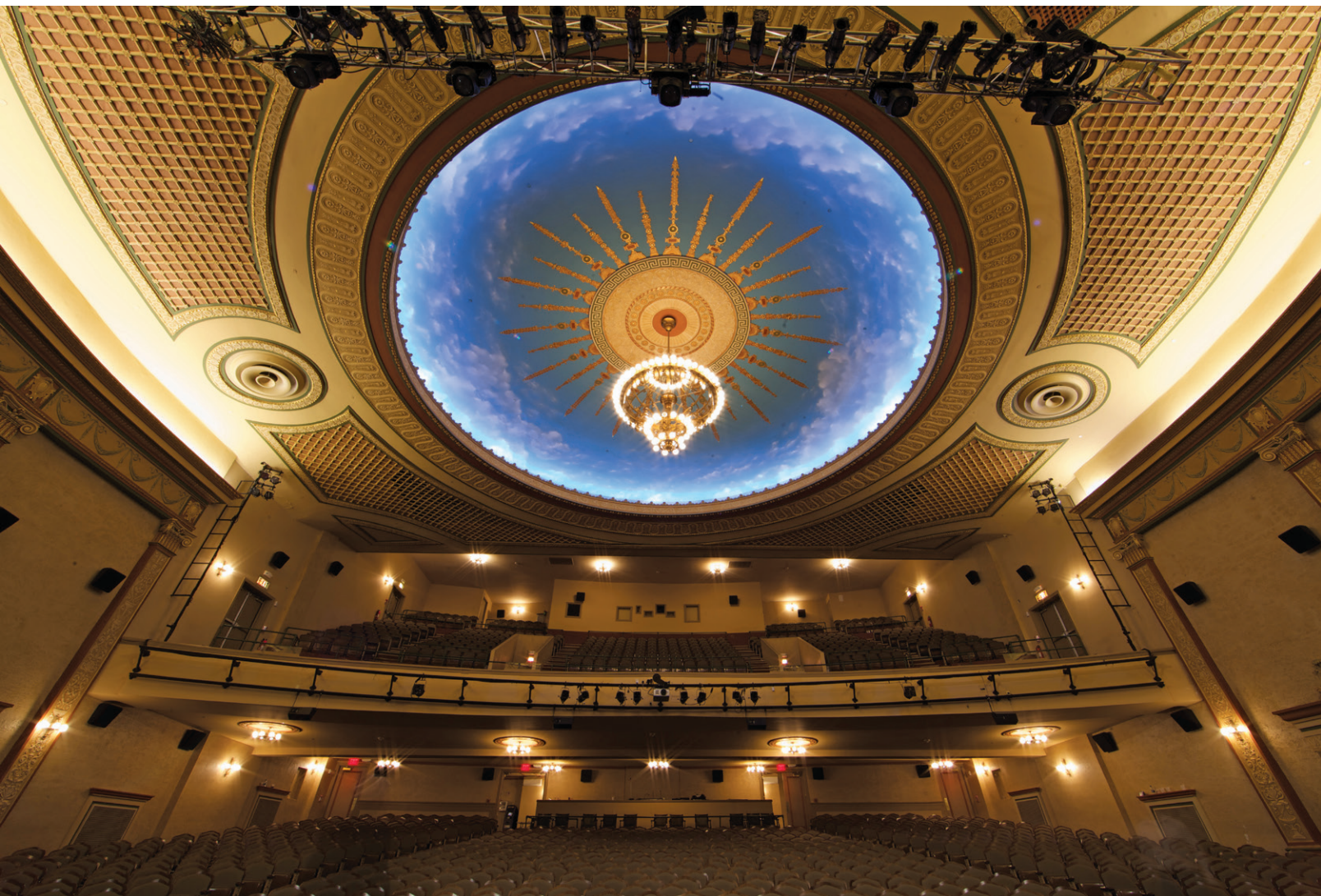
In 2008, The Basie underwent a massive interior restoration that brought the theater back to its original Spanish-influenced magnificence, similar to how it looked in 1926.