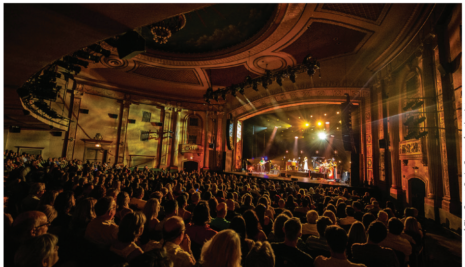
Performance at The Basie Center's Hackensack Meridian Health Theatre.

Additionally, it has become one of the nation's most acclaimed centers for the performing arts. In 2008, The Basie underwent a massive interior restoration that brought the theater back to its original Spanish-influenced magnificence, similar to how it looked in 1926. The building's exterior facade was restored in 2010, and today, The Basie's influence stretches well beyond the build-